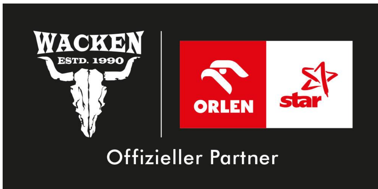
Logo: ORLEN Deutschland is the official partner of Wacken Open Air in 2023.

High-res and license-free photos are available for download in our Newsroom .